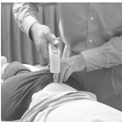
Using SRA Thermoscan to locate attachment points

This issue has lots of news, information and products designed to help you enhance your practice improve your results and offer your clients and patients the best possible care.